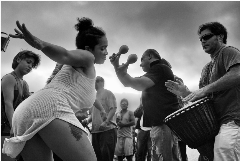
Venice Drum Circle