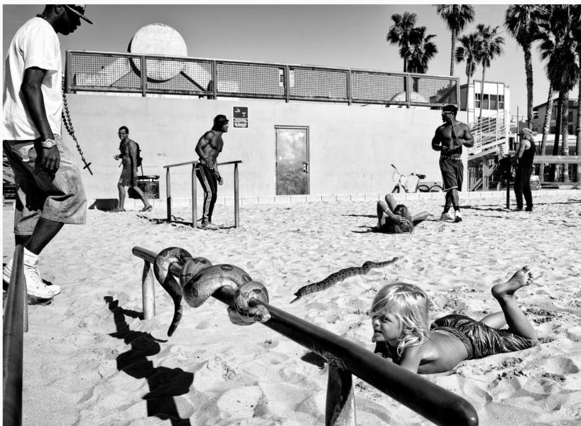
© Dotan Saguy Boy and Snake

Although Saguy's images are shot in black-and-white, there's no absence of color. There is not a single photograph that's dull or humdrum because this population is boisterous, connecting with every aspect of life. Whether parading around snakes, toying with mannequins, shredding on skateboards, flaunting wacky outfits, or dashing through the ocean waves like champions, these individuals embrace the undomesticated parts of their personalities, never worrying about formalities. In fact, as far as maintaining appearances, one could say the norm for them is to be completely and utterly unleashed .