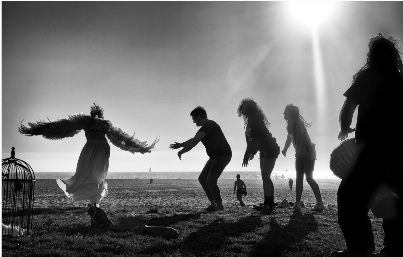
Freedom and the Bird