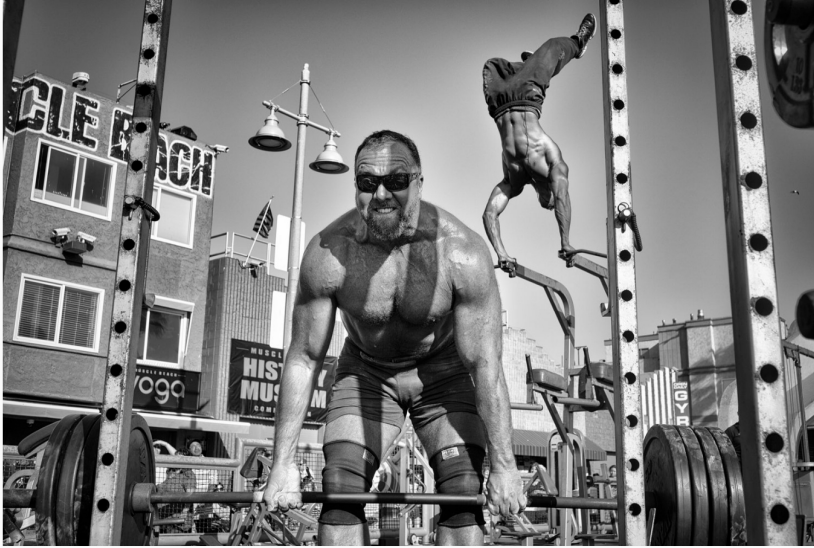
Muscle Gym Beach

sea creature coiled around a metal handle. In a different setting, it's more than likely that the average child would have shrieked and bolted from the snake for dear life—but not in Venice. Saguy shot this event to emphasize the exclusiveness of the culture. Fearless of the animal before him, this boy encompasses the attitude of those living in Venice Beach: marvels do not exist to be repulsive but respected and relished.