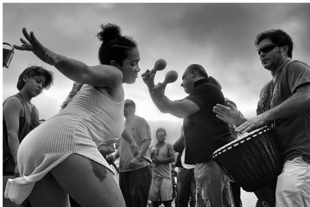
Una joven baila al ritmo frenético del Venice Beach Drum Circle, mientras el sol se pone sobre el océano en una tarde de verano.