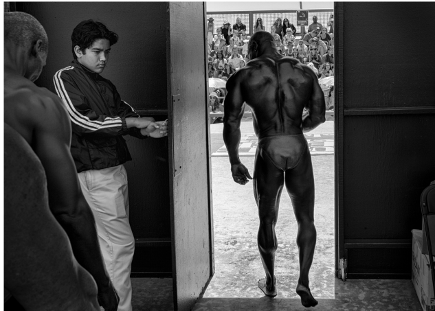
A bodybuilder enters the stage of the Mr. Muscle Beach contest. Its silhouette resembles that of the ancient Roman gladiator who enters an arena full of spectators who want to show.