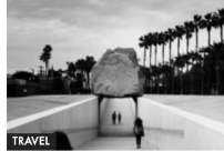
TRAVEL SAM MULLER: HOLLYWOOD HILLS