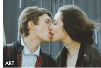
ART SAINT PETERSBURG DOES NOT SLEEP

REGIA is composed of carefully prepared sections, with new contents, rigorously selected and grouped in a clear and solid way. The editorial vision, more sophisticated and avant-garde, coexists with the aesthetic criterion and the curatorship that already characterizes us as a transgressor and cult means.