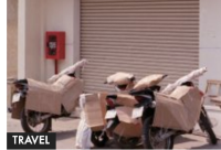
TRAVEL STEFAN GIFFTHALER: VIETNAM