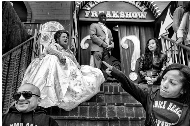
The closing of Venice Beach Freakshow was on April 30, 2017 and may have been one of the most emblematic moments of Venice Beach gentrification. After a decade of outmoded circus performances, with two-headed turtles, five-legged dogs, bearded women, slots and other cast members glorifying strangers and outcasts, Venice Beach Freakshow was forced to abandon its iconic location on the sea trip. Guilty? Snapchat that does not stop expanding and bought the building.

"It's a bit ironic because Venice is in many ways the antithesis of Los Angeles, but it's the place I most identify with," he says. "I love their diversity, their anti-materialism, their rebellious nature. There are many things below the surface that most tourists do not see. Tourists walk along the promenade of Venice and all they see are homeless people, fans, wild children and greased bodybuilders. They go to Venice because on the surface it looks like a circus. But if you spend enough time there, you discover that they are all people with a story to tell."