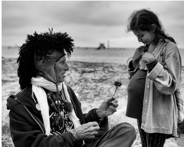
Esta foto es algo así como un misterio. El hombre mayor, quien toma el nombre de "Jingles", ha estado predicando por los derechos de los animales y un estilo de vida vegano durante muchos años desde su puesto en el paseo costero de Venecia. Tal vez le esté dando a esta joven futura madre una especie de bendición.