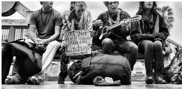
A group of young hippies sing on a bench in front of the Muscle Beach Gym.