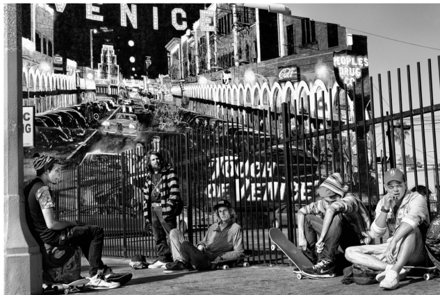
Un grupo de skaters se reúnen para fumar marihuana bajo el sol frente al emblemático mural Touch of Venice en Windward Avenue.